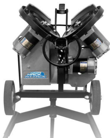
Feed Chute with 3 Concave Wheels